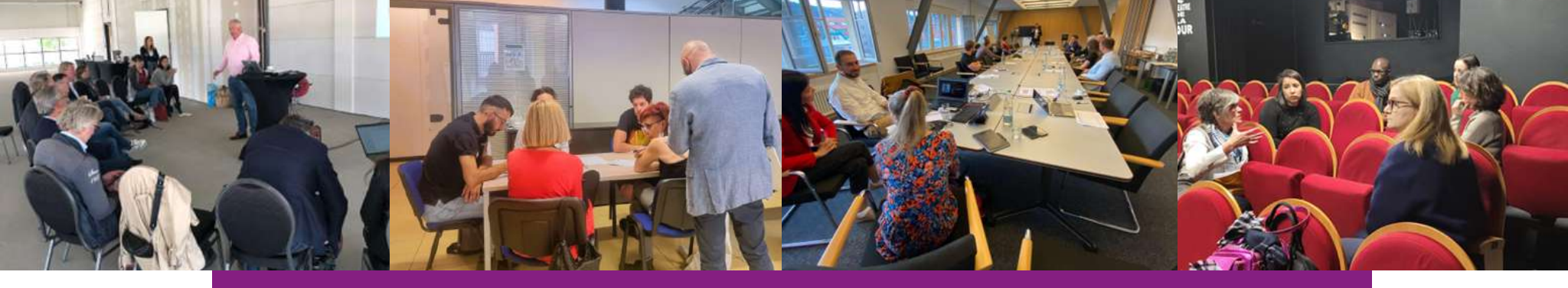
Local workshop organised in Rotterdam , Nice , Stuttgart , Turin